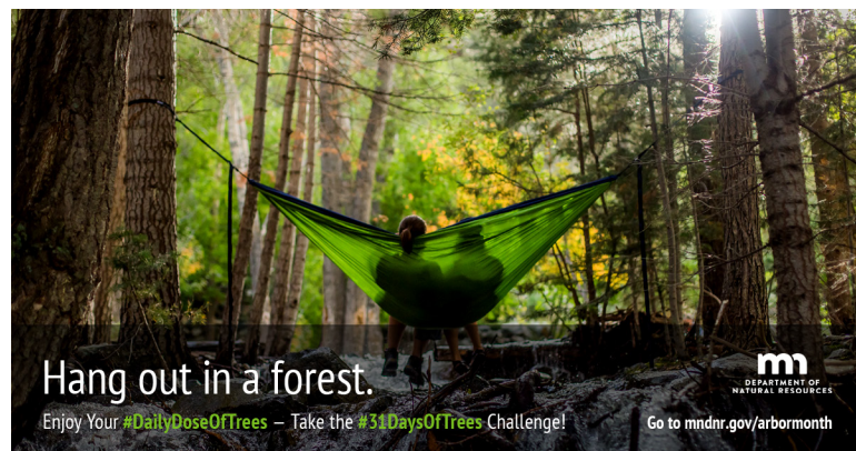
MNDNR #31 DaysOfTrees Challenge Social Media Campaign

Develop a targeted social media campaign to millennial Minnesotans to create awareness of the DNR Arbor Month key messages featuring the health benefits of trees by promoting participation in a 31-days of trees challenge.